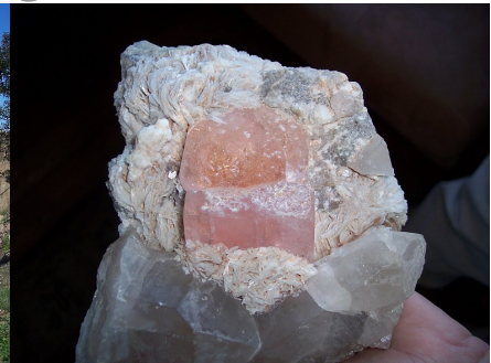
Beryl, var. Morganite on Cleavelandite on Quartz*