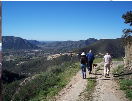
Pala Chief Mine Area