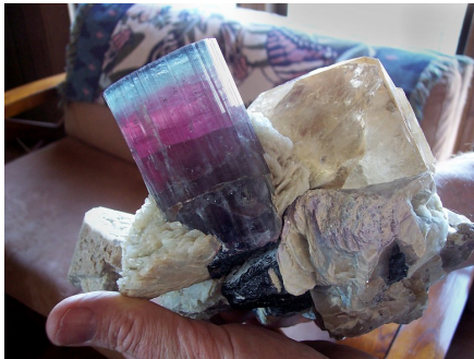
Elbaite on Cleavelandite on Quartz*