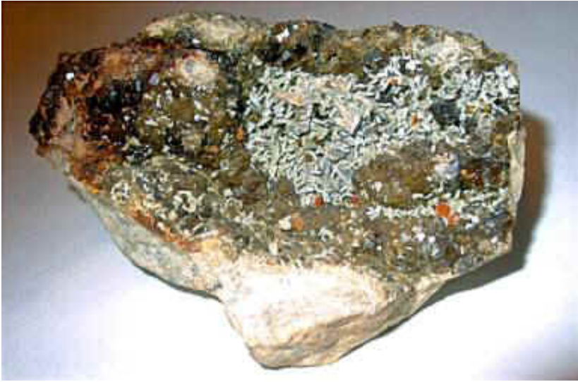
Rosasite, Lucky Lucy mine.