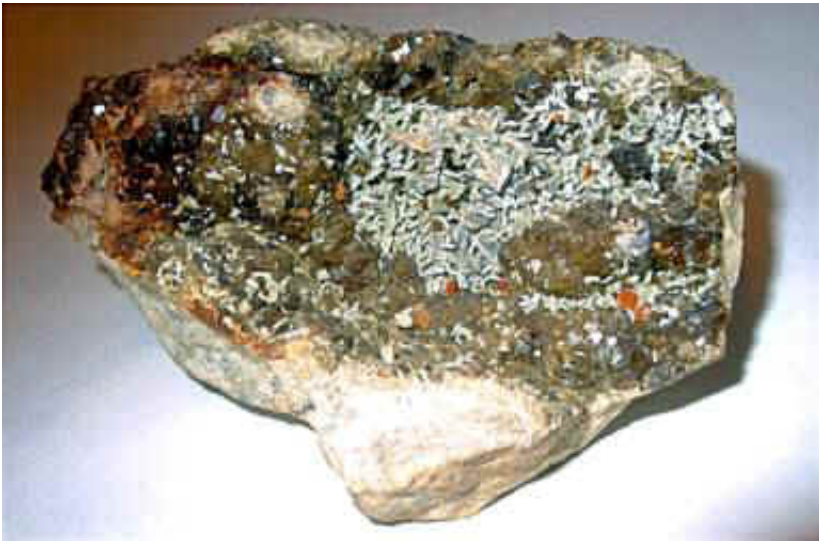
Tremolite on andradite. Specimen is 8 cm long Custer Mine