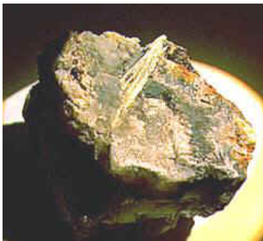
Two cm spray of bismutite after bismuthinite, Frenando mine.

There are many small mines and prospects scattered through out the area. Most contain only chrysocolla and low-grade scheelite. The area on the geologic map designated "hornfels with undifferentiated tactite" has small micros of epidote with titanite, orthoclase and andradite crystals.