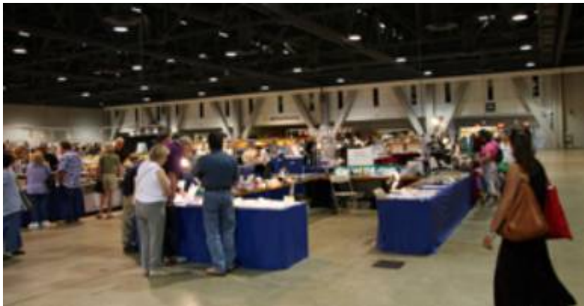
The Southern California Gem and Minerals Show in full swing at the Long Beach Convention Center on Oct. 15, 2005.