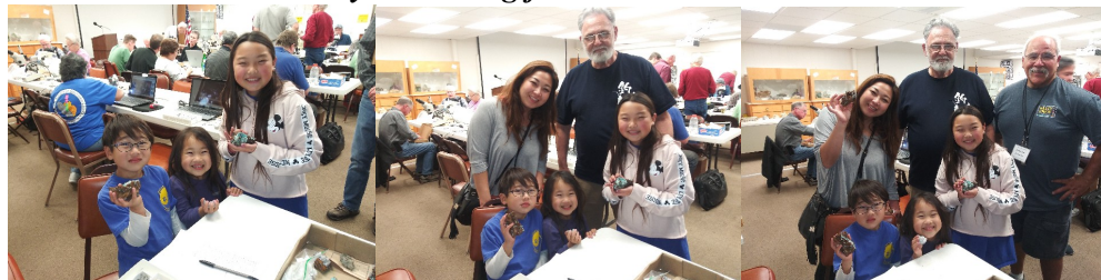
We had guest from Japan that I invited, they were staying with a fishing buddy of mine from San Diego. They have been collecting rocks and tumbling them with a couple of tumblers I gave them. We made sure they took home some great minerals.