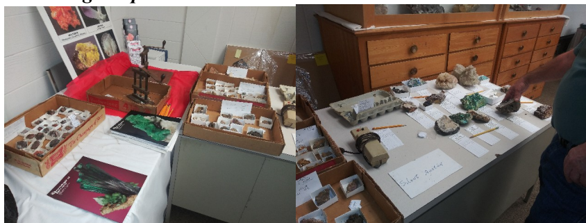
Silent Auction Items