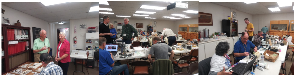
Everyone having fun and hard at work.